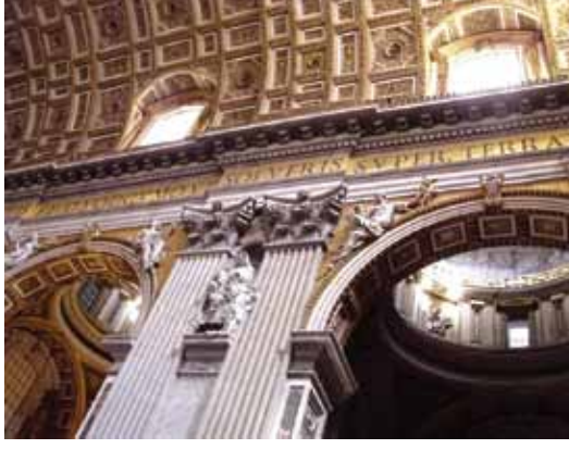
One of the highlights of the history trip to Italy and Greece was seeing St. Peter's in Rome.

The most recent iteration of the three-credit course ran this past spring, from May 5th to 22nd. Before leaving for the eighteen-day trip to England, Wales, and Scotland, students met a number of times to prepare for the trip, chiefly to ensure that they had some input into the itinerary. The itinerary itself emphasized major authors and major literary movements, so