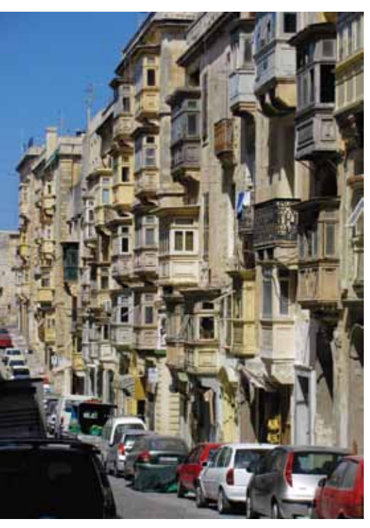
A street in Valletta, capital of Malta.